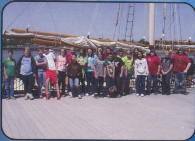
*FIELD TRIP* The 6th grade class stops for a quick picture before boarding the Schooner Appledore .